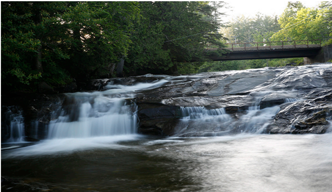
Calendar Brook Falls- World Waterfall Database